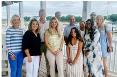
The team celebrated with Cathcart Group Executives on 7/11/24.

On 6/25/2024, The Gallery at Godwin achieved their lease-up goal of 95% leased! The team has worked diligently over the past nine months to reach this major milestone - three months ahead of schedule!